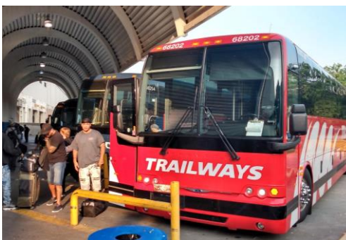
A Burlington Trailways coach is in the final boarding process at Indianapolis in October 2021

Whereas intercity buses provide about 152 passenger-miles of transportation per gallon of fuel consumed, single-occupant motorists average only about 30, airplanes about 40 and diesel trains around 50 - 120 2 .