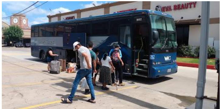
A Greyhound bus bound for McAllen, TX boards at South Houston in August 2021

A range of services available on the national network of intercity bus schedules are sold on the websites of Greyhound, Trailways and booking sites like Wanderu.com. Our analysis shows that schedules have markedly increased since early 2021. 3 Examples of bus lines that are part of this national network are Adirondack Trailways, Barons Bus, Burlington Trailways, Greyhound, Indian Trails, Jefferson Lines, Martz Trailways, Miller Transportation, New York Trailways, and Peter Pan . This system of connecting lines allows for travel on a single ticket to tens of thousands of origin/destination combinations.