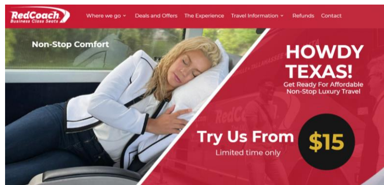
A RedCoach website photo featuring its generously reclining first-class seats

c. Multimodal ground operator Landline expanded bus service linking the Ft. Collins, CO, and Denver International Airport (DIA) to five daily for its “codeshare partner” United Airlines.